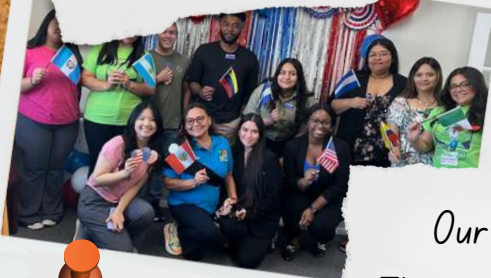
Our second Citizenship Clinic