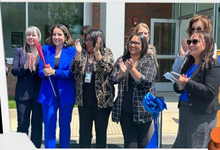
We moved back to Central Islip....