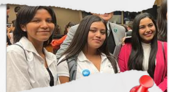
Girls A.C.T. went to the United Nations