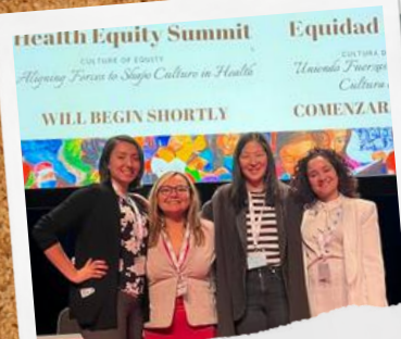
Our very first Health Equity Summit