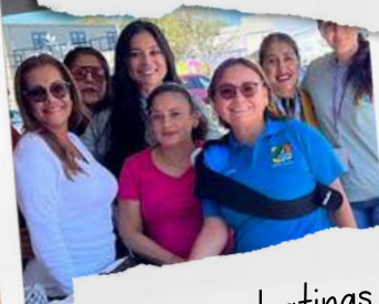
Thriving Latinas at Arts on Terry