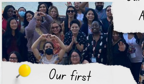
Our first National Sexual Assault Conference