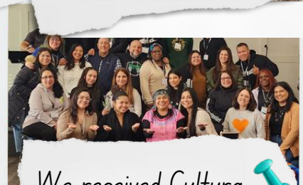
We received Cultura Cura training