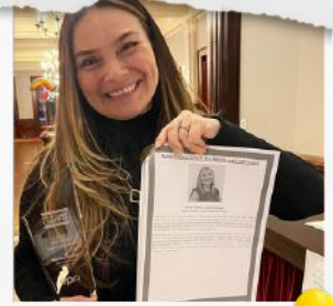
We received the Epic Women Award for Justice & Advocacy