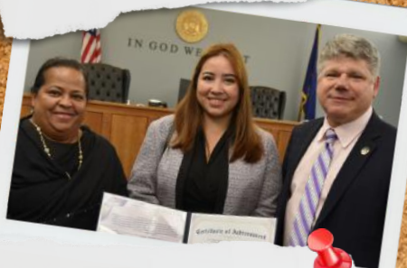
We were honored at the Suffolk County Women in Court's celebration