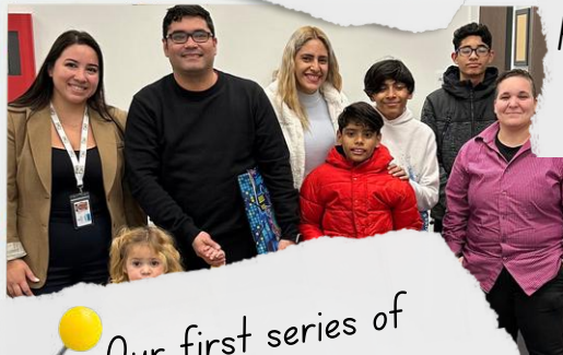
Our first series of Work Permit Clinics