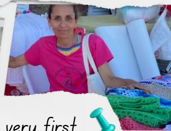
Our very first Thriving Latinas Expo