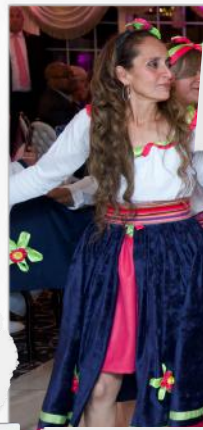
We celebrated our 30th Anniversary Gala